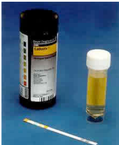
Urine samples can be tested for the presence of glucose and ketones using special 'dip sticks' which give a rapid result

Diabetes mellitus is suspected in cats showing the appropriate clinical signs but other diseases may also cause similar signs. For example, other important causes of weight loss in an older cat including kidney disease, cancer, hyperthyroidism (overactive thyroid gland) and inflammatory bowel disease need to be ruled out. The earlier that diabetes can be detected the better and so routine urine checks in cats above 7 years old are recommended.