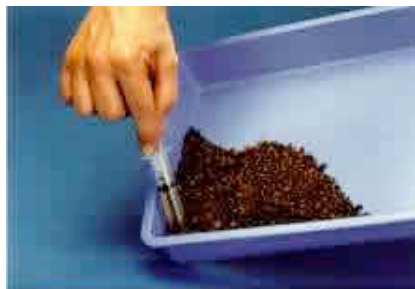
Urine samples can be collected by using non-absorbent cat litter or aquarium gravel instead of normal cat litter

Blood and urine tests are required to confirm a diagnosis of diabetes. Although hyperglycaemia and glycosuria are found in diabetic cats, cats can also suffer from a stress-associated hyperglycaemia which can cause glycosuria and therefore confuse diagnosis. For this reason, a single blood or urine sample cannot be considered as diagnostic of diabetes. One solution to this problem is for the cat's owner to collect a urine sample whilst the cat is in its non-stressful home environment. The easiest way of doing this is to replace normal cat litter with non-absorbent cat litter (supplied by a vet) or clean aquarium gravel so that a sample can be collected. The urine sample can be taken to a veterinary surgeon for testing or the hospital may give you some test strips to use at home. Another solution is to measure the blood levels of fructosamine which more accurately reflects the long-term blood sugar levels and so may help to distinguish between stress-associated hyperglycaemia and diabetes mellitus. Fructosamine is a glycosylated serum protein molecule which is present in higher concentrations when the blood glucose concentration is high. An elevation in serum fructosamine indicates that there has been significant hyperglycaemia during the previous two to three weeks. This test can also be used for long-term monitoring of how well stabilised a diabetic cat receiving therapy is.