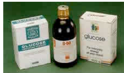
It is sensible to obtain some glucose powder in case your diabetic cat suffers from low blood sugar (hypoglycaemia) at any time. Also shown is glucose solution which can be given by injection, by a veterinary surgeon, in severely affected cases

If a positive ketone result is seen, immediate veterinary advice should be sought. This rule applies even if the cat