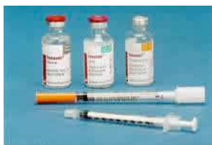
Several different types of insulin are available. Special insulin syringes, which have very fine needles, are also shown here

In most diabetic cats, insulin therapy is required, at least initially. Insulin is given by an injection under the skin of the scruff and most cats will be stabilised on a regime involving either once or twice daily injections. The exact site of administration should be changed on a daily basis to reduce any scarring or reaction at the injection site which may limit insulin absorption. Special insulin syringes with very fine needles are used so that the cat will hardly feel the injection. Veterinary surgeons often recommend that diabetic cats are offered food just before they receive their insulin so that the cat is distracted by eating and does not notice the injection.